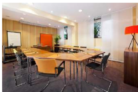
Conference room 2

Our seminar room two (35 square meters) and our library (20 m 2 ) are available for working in groups. We charge a daily room rental of EUR 250 for the seminar room and EUR 180 for the library.