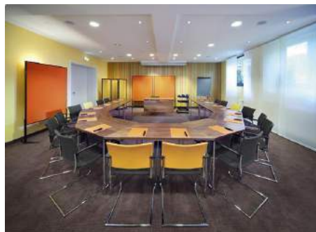
Conference room 1