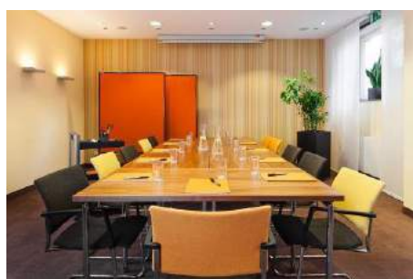
Conference room 2