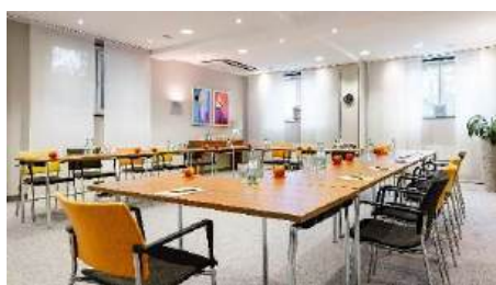
Conference room 1

Our seminar room two (35 square meters) and our library (20 m 2 ) are available for working in groups. We charge a daily room rental of EUR 280 for the seminar room and EUR 200 for the library.