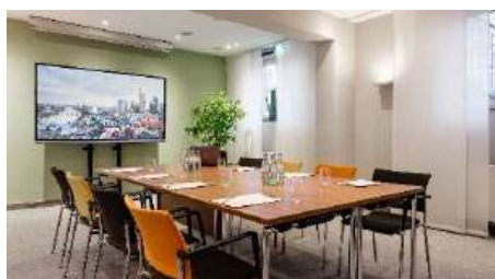
Conference room 2