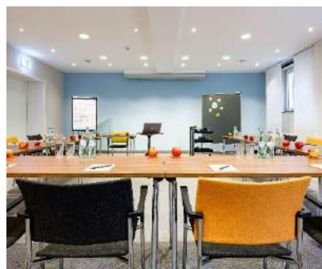
Conference room 1